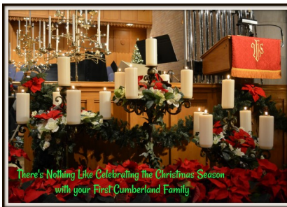
This month's card